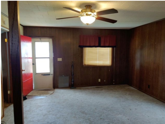
Living Room – 13'11" x 17'3"