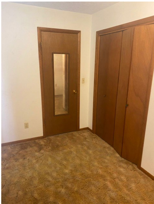
L Shaped Bedroom – 10'11" x 9'1"