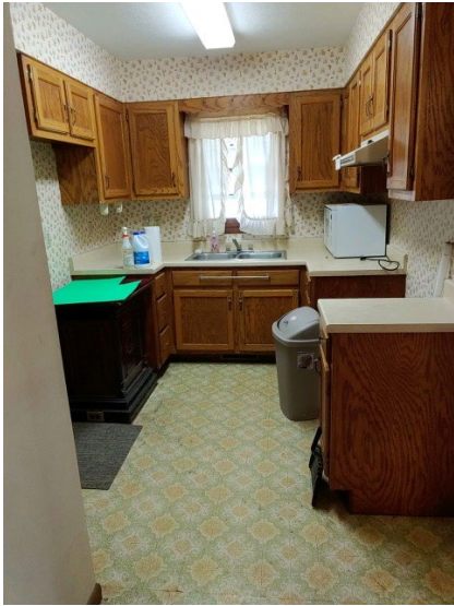
Kitchen – 7'10" x 11'6"